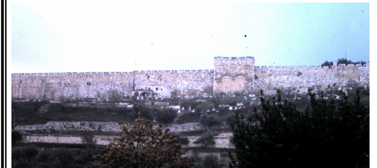
The Eastern (or Golden) Gate in the reconstructed wall that encircles Temple Mound in Jerusalem. The view is from the Mount of Olives. This gate approximates the entrance of Jesus on Palm Sunday.

Maundy Thursday Holy Communion and Tenebrae Service 7:00 p.m. in the Sanctuary